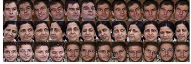
Fig. 2. Examples of color face images in GTFDB database.

In this section, experiments will be conducted to evaluate the performances of the proposed QDDA. First, we introduce the experimental setting. Then the effects of quaternion decomposition directions are studied. Finally, QDDA is compared with other quaternion-based discriminant analysis methods.