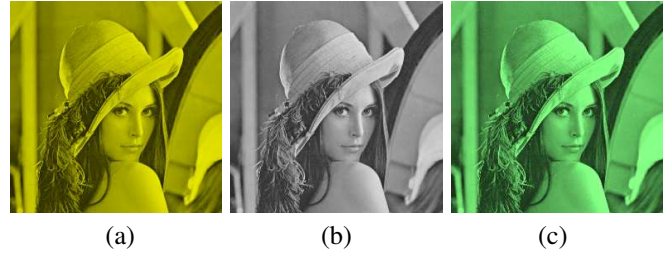
Fig. 1. The parallel components of decomposition results for color Lena image using different decomposition directions given in Table I respectively: (a) \dot{p}_2 = \frac{i+j}{\sqrt{2}} , (b) \dot{p}_3 = \frac{i+j+k}{\sqrt{3}} , and (c) \dot{p}_4 = \frac{i+2j+k}{\sqrt{6}} .

color pixel respectively. \dot{Q}(x, y) gives a one-to-one mapping between the quaternionic domain and RGB color space. Any operations to \dot{Q}(x, y) will affect all the color channels at the same time.